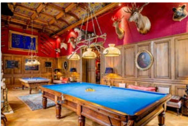
The billiard room